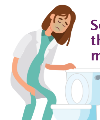
Severe nausea and throwing up (not like morning sickness)