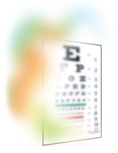
Changes in your vision