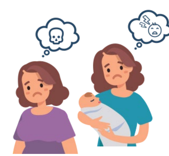
Thoughts about hurting yourself or your baby